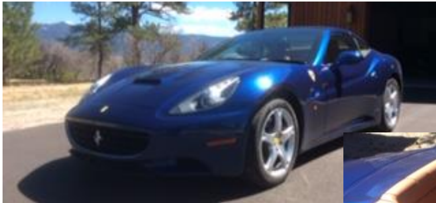
2010 California - TDF Blue with Cuoio interior 6800 miles. Very good condition with up to date service performed by Ferrari of Denver. Excellent options including Daytona seats,

fender shields, tunnel leather and cruise control. Sold new at Ferrari of Denver. I am the second owner. Asking $110,000. Please call 608-345-5085 or email tailshappy@charter.net .